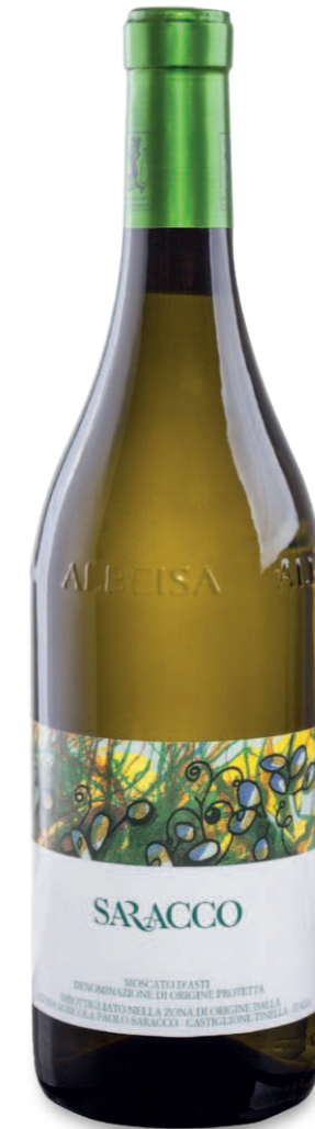
Moscato d'Asti DOP

ACCORDING TO SOME EXPERTS, MOSCATO (MUSCAT) WAS THE FIRST AROMATIC GRAPE IN HISTORY. THE DIFFERENT TERROIRS OF ITALY LED TO DIFFERENT CLONES. IN ASTI IT IS CHARACTERIZED BY NOTES OF ORANGE, PEACH AND LIME, AND RICH IN MINERALS. IT'S A VERSATILE GRAPE, PERFECT FOR SPARKLING WINES.