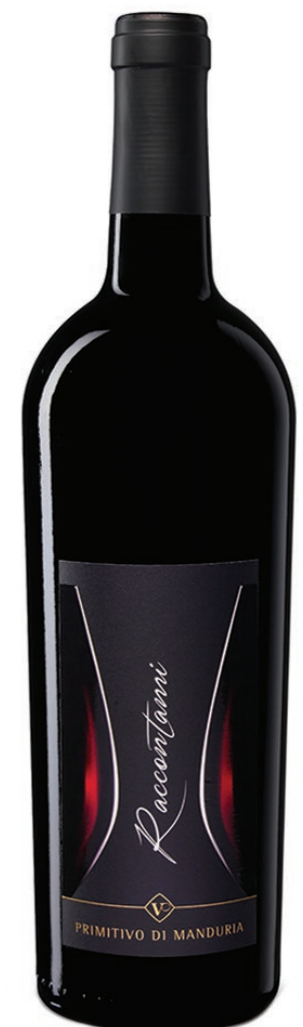
Raccontami Primitivo di Manduria DOC