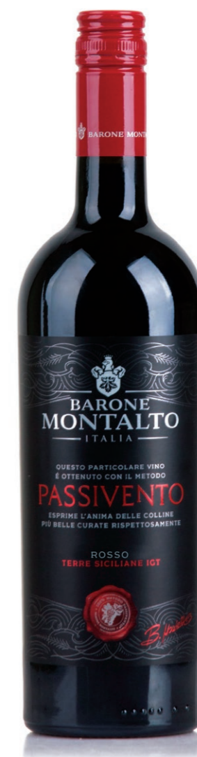
Rosso Passivento Rosso Terre Siciliane IGT