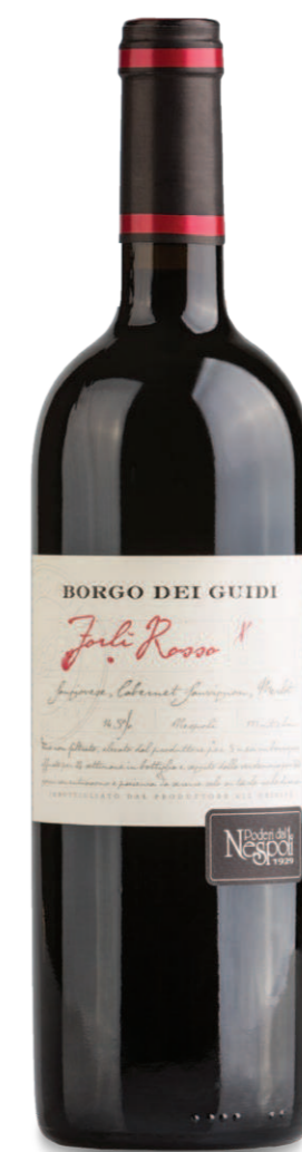
Borgo dei Guidi Rubicone IGT Sangiovese - Cabernet Sauvignon