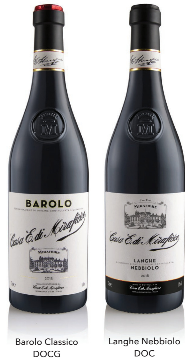
Barolo Classico DOCG

A VERY RARE PRICE LIST FROM 1896 PROVES THAT MIRAFIORE WAS ALREADY SELLING ITS WINES OVER A CENTURY AGO. THE WINE WAS THEN SOLD IN CASKS OR CASES, AND THE GOODS TRAVELLED “AT THE CUSTOMER’S RISK AND PERIL.” BAROLO, AVAILABLE IN VARIOUS VINTAGES, WAS SOLD IN BOTTLES OF COURSE.