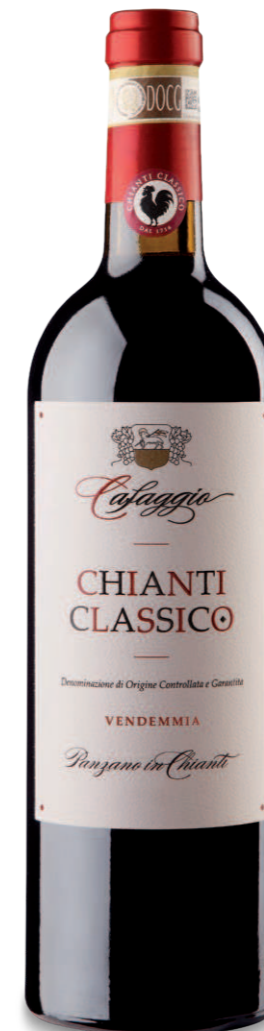
Chianti Classico DOCG