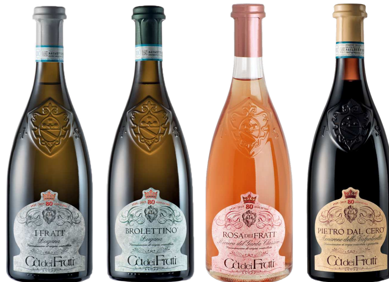
I Frati Lugana DOC