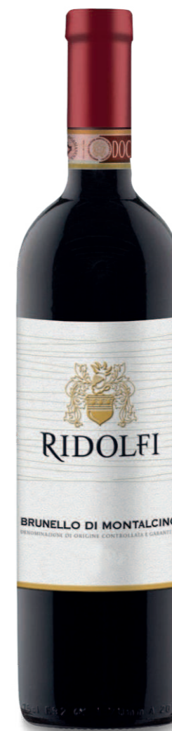
Brunello di Montalcino DOCG

THE ANCESTOR OF THE FOUNDERS, COSIMO RIDOLFI, WAS A POLITICAL MAN AND PROFESSOR AGRONOMIST AT THE UNIVERSITY OF PISA. HE WAS THE FIRST ONE TO PRAISE THE NAME OF MONTALCINO WINES ABOVE THE OTHERS IN THE REGION, IN 1831.