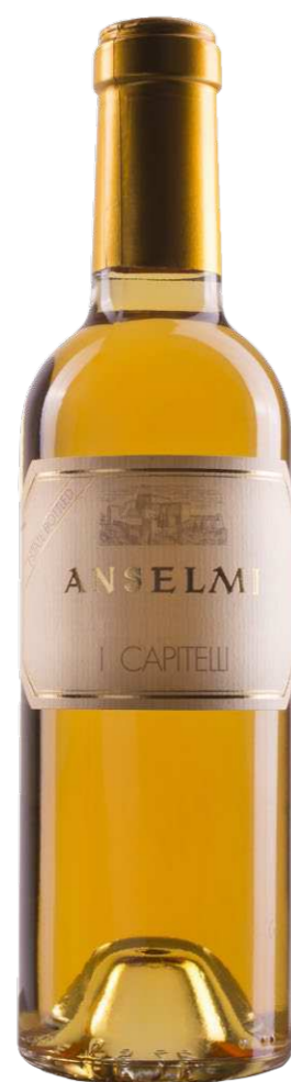
I Capitelli Veneto IGT