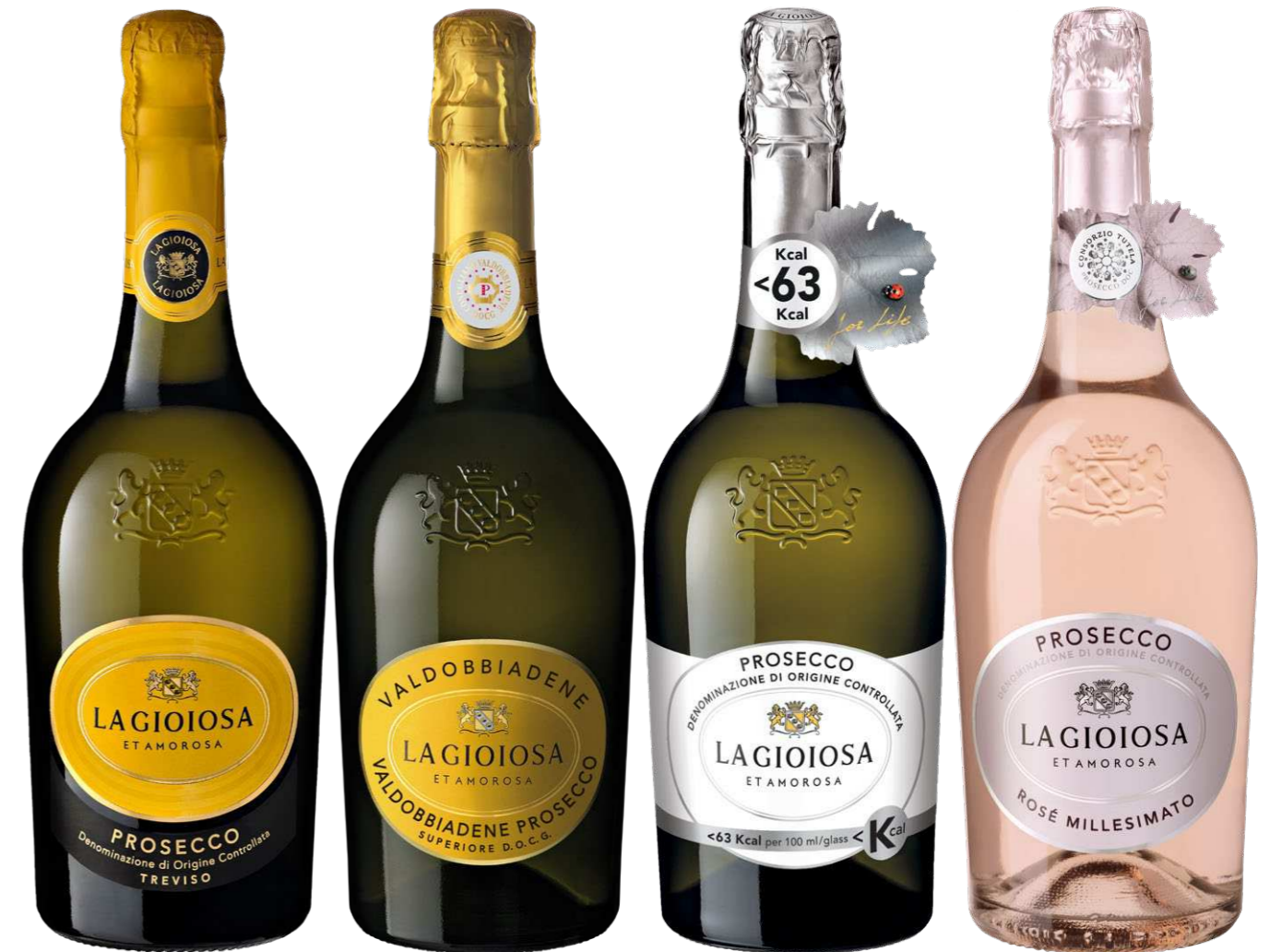
Prosecco DOC Treviso Brut