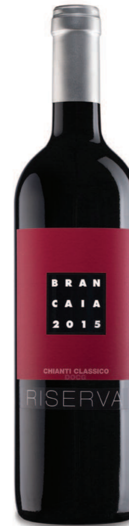
Chianti Classico Riserva DOCG