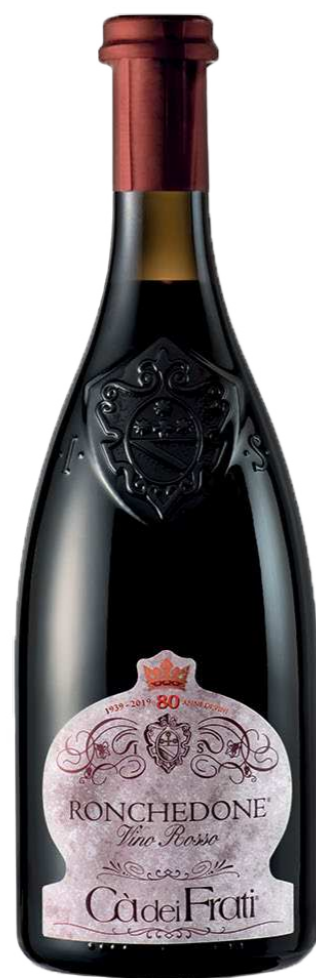
Ronchedone Vino Rosso IGT