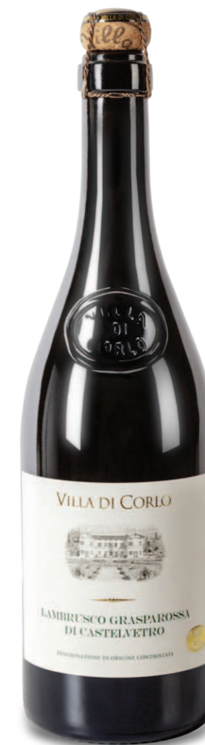
Lambrusco Grasparossa di Castelvetro DOC Dry

VILLA DI CORLO PAYS A STRONG ATTENTION TO ENVIRONMENTAL SUSTAINABILITY. IN 2012 THEY DECIDED TO USE RENEWABLE SOURCES OF ENERGY THROUGH SOLAR PANELS PLACED ON THE WINERY'S ROOF, THUS REDUCING THEIR EMISSIONS OF GREENHOUSE GASES AND ENVIRONMENTAL IMPACT.