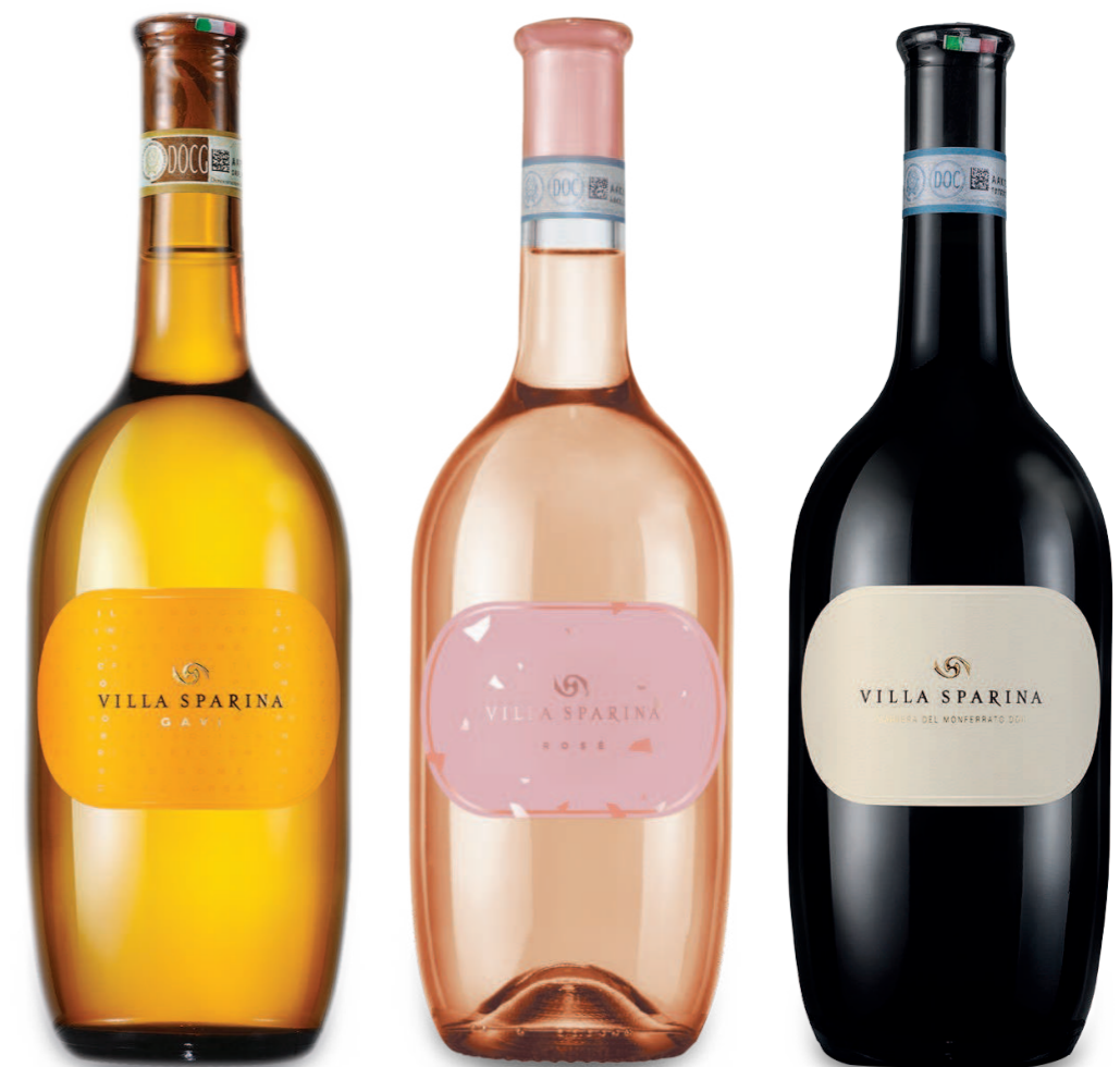
Gavi del Comune di Gavi DOCG