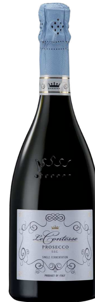
Prosecco DOC Brut

SPARKLING WINES LIKE PROSECCO ARE TYPICALLY MADE WITH THE CHARMAT METHOD. THE SECOND FERMENTATION OF THE BASE WINES TAKES PLACE IN A LARGE TANK, BY ADDING A MIXTURE OF SUGAR AND YEAST. WHILE MAKING THE WINE BUBBLY, THIS METHOD ENHANCES THE WINE'S FRESHNESS AND FRUITY AROMAS.