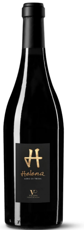
Helena Nero di Troia IGP