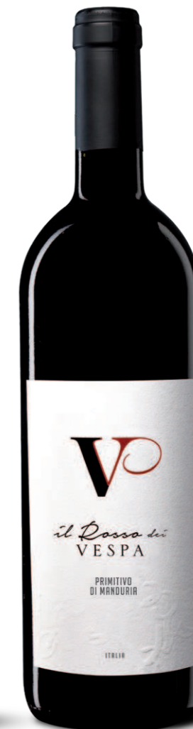
Il Rosso dei Vespa Primitivo di Manduria DOC