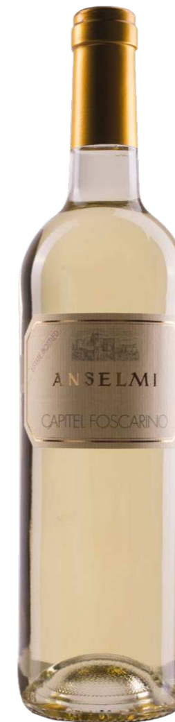
Capitel Foscario Veneto IGT