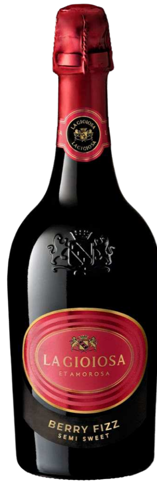
Berry Fizz Sparkling Red