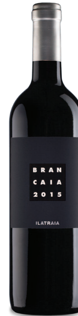
Ilatraia IGT Rosso Toscana