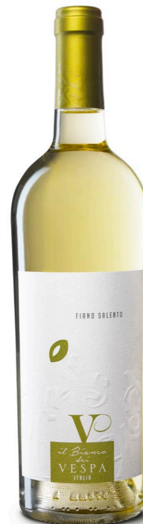
Il Bianco dei Vespa Fiano Salento IGP