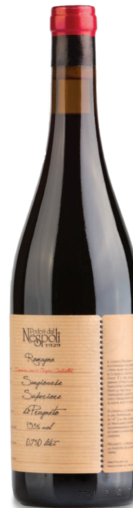
Prugneto Romagna DOC Sangiovese Superiore