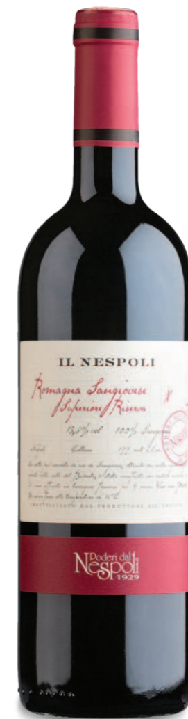
Il Nespoli Romagna DOC Sangiovese Superiore Riserva