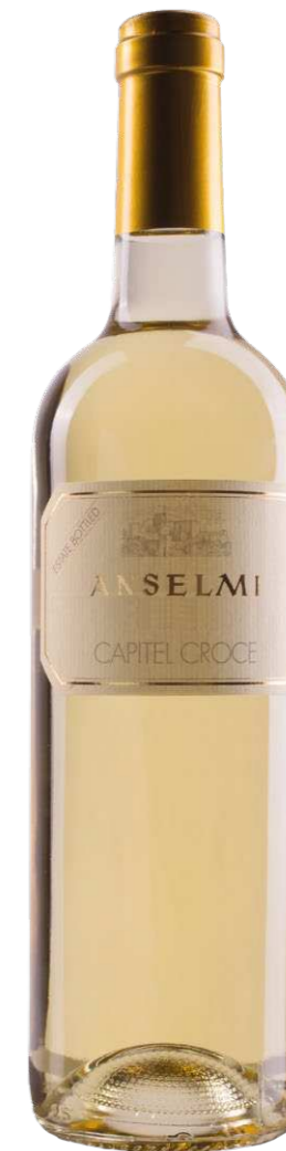
Capitel Croce Veneto IGT