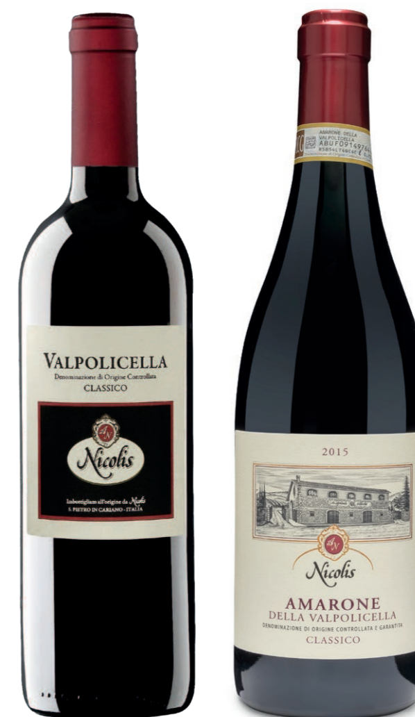
Valpolicella DOC Classico