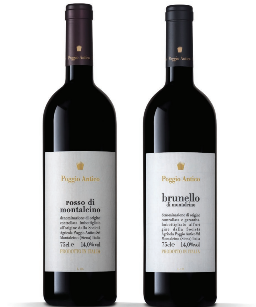
Rosso di Montalcino DOC

ALL POGGIO ANTICO WINES ARE AGED IN THE BOTTLE LONGER THAN REQUIRED BY LAW AND STORED IN THE PROPERTY'S NATURALLY COOL UNDERGROUND CELLAR TO GUARANTEE THE UTMOST PLEASURE IN THE GLASS.