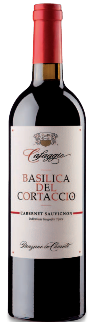
Basilica del Cortaccio Cabernet Sauvignon IGT