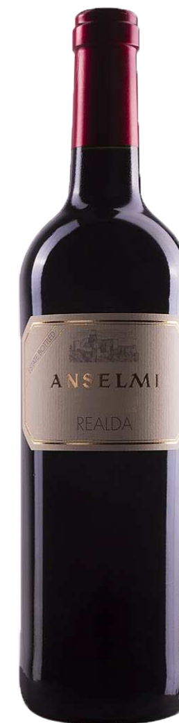
Realda Veneto IGT