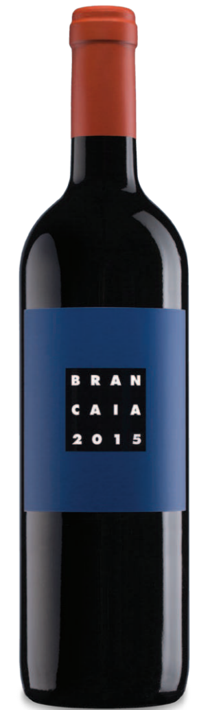
Il Blu IGT Rosso Toscana