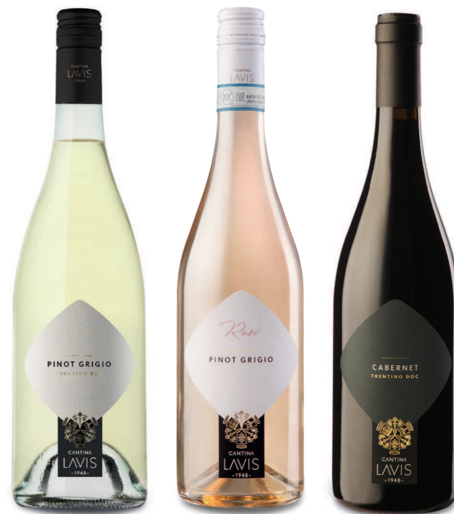
Pinot Grigio Trentino DOC

TWO PROJECTS HAVE BEEN CRUCIAL FOR THE QUALITY OF LAVIS WINES: THE “ZONING PROJECT”, ANALYZING THE SOIL, CLIMATE AND SUN EXPOSURE OF EACH VINEYARD TO PLANT THE RIGHT VARIETY IN THE RIGHT PLACE, AND THE FOLLOWING “QUALITY PROJECT”, IDENTIFYING SOME OF THE FINEST VINEYARDS.