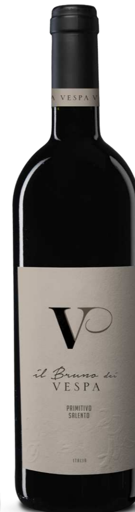
Il Bruno dei Vespa Primitivo Salento IGT