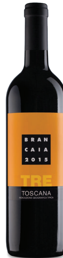
TRE IGT Rosso Toscana

THE STORY OF THIS UNIQUE BRAND GOES HAND-IN-HAND WITH THE RELEASE OF THE FIRST VINTAGE OF BRANCAIA IL BLU IN 1988. AFTER ALL THESE YEARS, THE LABEL IS STILL MODERN, ELEGANT AND TIMELESS. AND THAT'S HOW BRANCAIA SEE THEMSELVES AS WINE PRODUCERS: CLASSIC MODERNISTS WITH THE UTMOST RESPECT FOR THE TERROIR.