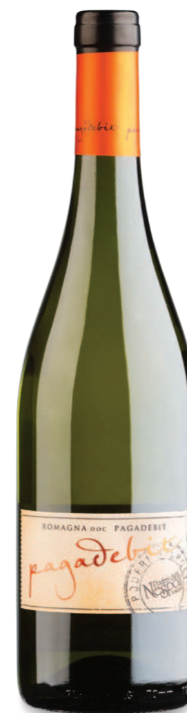
Pagadebit Romagna DOC