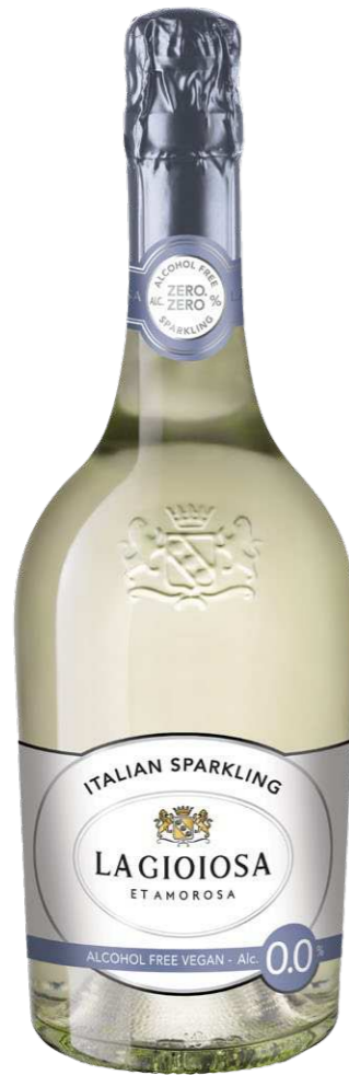
Italian Sparkling Alcohol Free