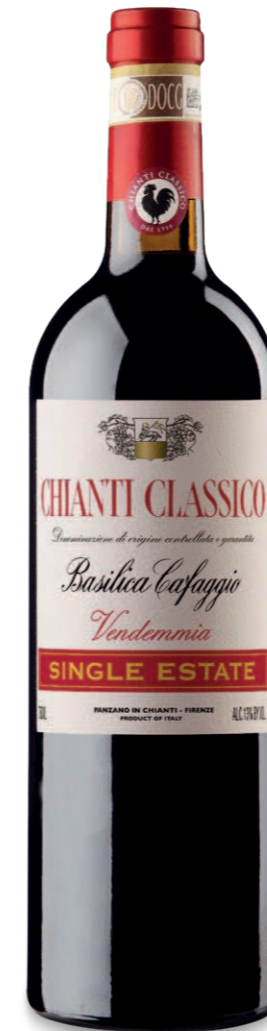
Single Estate Chianti Classico DOCG