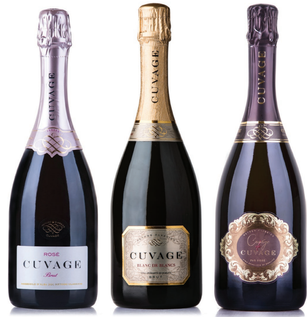
Rosé Brut Nebbiolo d'Alba DOC