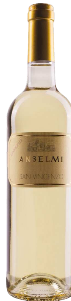
San Vincenzo Veneto IGT