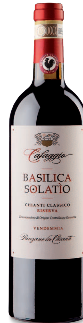
Basilica Solatio Chianti Classico Riserva DOCG