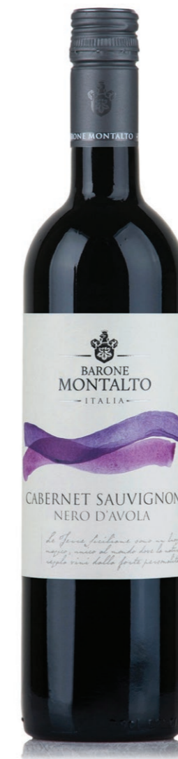
Nero d'Avola, Cabernet Sauvignon

A PART OF THE VINEYARDS ARE LOCATED IN THE VALLEY OF THE TEMPLES – DID YOU KNOW THAT THIS IS THE LARGEST ARCHEOLOGICAL SITE IN THE WORLD WITH 1,300 HECTARES?